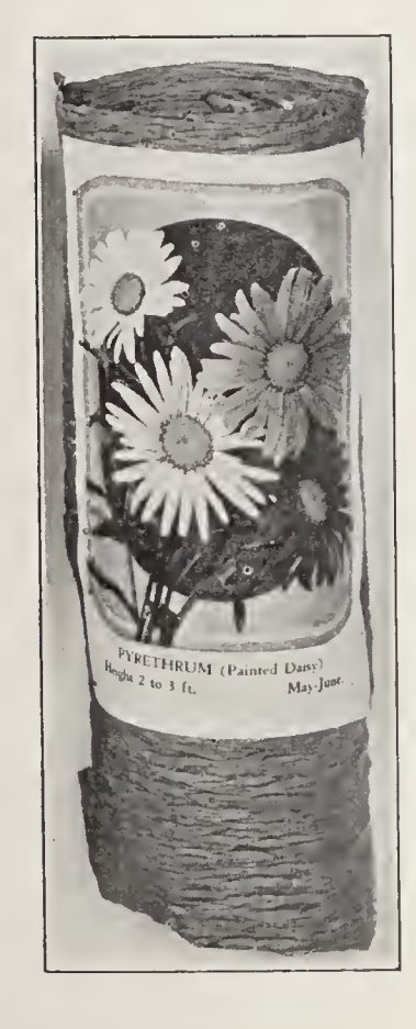
All wrapped in moisture-proof paper with colored label and growing instructions.

All of the above: $1.00 per doz., $7.00 per 100, $65.00 per 1000 (25 at 100 rate, 250 at 1000 rate)